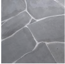
Blueocean Sawn, P5