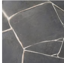
Blueocean Honed, P3